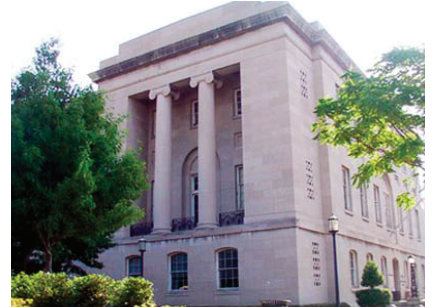
Photo: DC Courts & U.S. Court of Appeals for the Armed Forces, Washington, DC

DC COURTS & US COURT OF APPEALS FOR THE ARMED FORCES COMPLEX, WASHINGTON, DC - AFG provided cohesive Program Management services for the $160M integrated design and construction program involving the demolition, new construction, historic modernization, and tenant build-out of numerous facilities, spanning over 1.2M SF. AFG assisted GSA with program financial management, program stakeholder management and program governance.