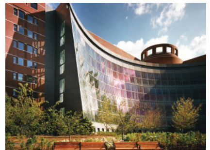
Photo: Boston Federal Courthouse, Boston, MA

BOSTON FEDERAL COURTHOUSE, BOSTON, MA - On the new 765,000 SF, 10-story courthouse, featuring 27 courtrooms, offices, a cafeteria, court library, and prisoner circulation, AFG provided value engineering, change order estimating, and negotiations support for the General Services Administration (GSA).