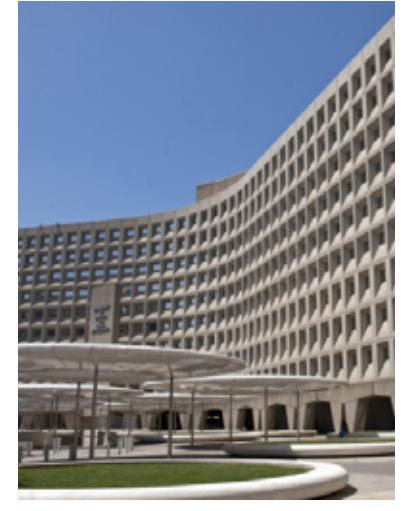
GSA Weaver Federal Building Fire Alarm Installation, $10M, Washington, DC