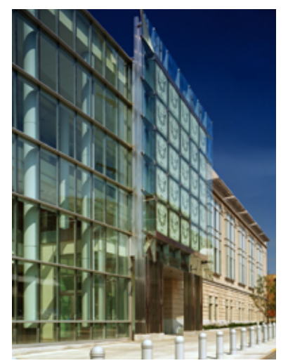
GSA Wheeling Federal Courthouse Fire Alarm Replacement, $1M, Wheeling, WV