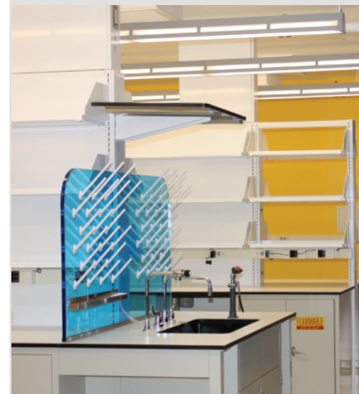
National Institutes of Health (NIH) Construction Quality Management & Commissioning IDIQCI Bethesda, MD | $90M