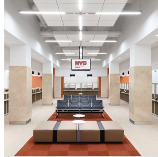
NYC Department of Finance Renovation Brooklyn, NY | $10M