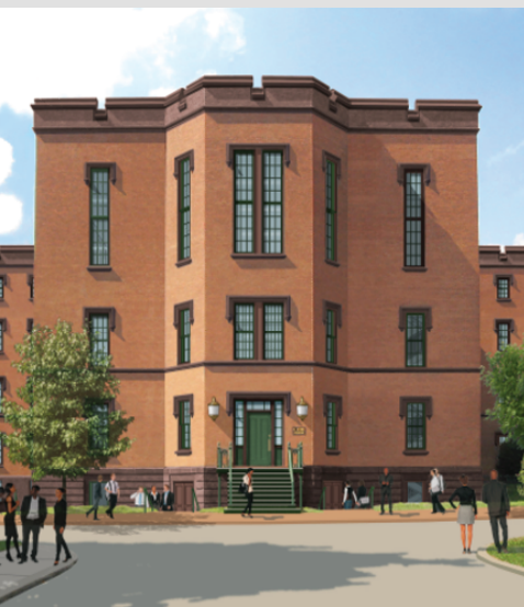
GSA/DHS Headquarters St. Elizabeths West Campus, Phase II - Winner of Two CMAA NCC Project of the Year Awards Washington, DC | $450M