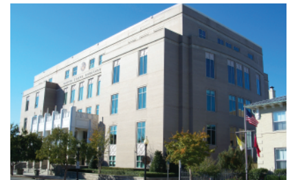
Pensacola Federal Courthouse Pensacola, FL Interior / Exterior Renovation Project