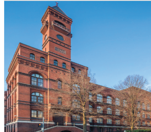
GSA Yates Federal Building Exterior Restoration Washington, DC | $16.6M CMAA Project of the Year