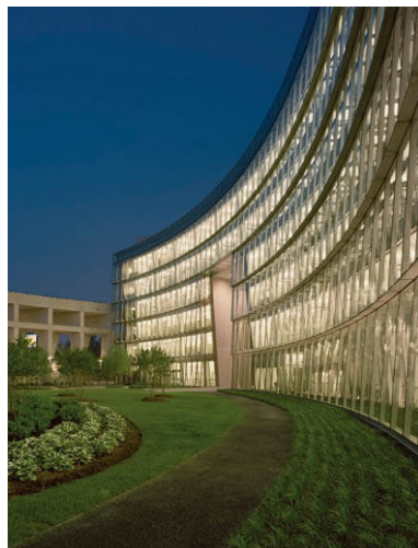
GSA National Deep Energy Retrofit 2 (NDER2) & Cx Program, Washington, DC