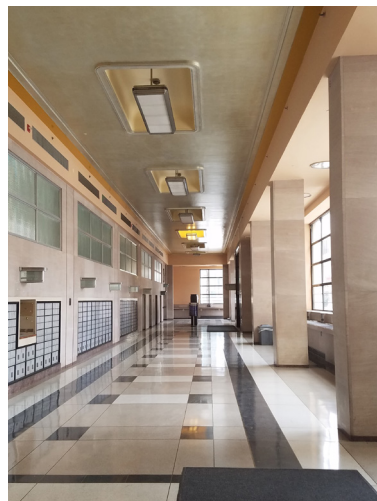
GSA Robert Nix Federal Courthouse Renovation, CM & Cx, Philadelphia, PA