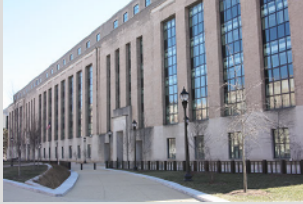
Photo: Mary E. Switzer Federal Building, Washington, DC

GSA HHS MARY E. SWITZER FEDERAL BUILDING CONSOLIDATION, WASHINGTON, DC - In one of the largest GSA consolidation projects of 2016, 1,600 employees, 11 HHS facility sites, 5 HHS Divisions, and over 40 stakeholders counted on AFG and GSA to seamlessly execute the $49.4M project. Finished under-budget, the project won the CMAA National Capital Chapter 2017 Construction Management Excellence Award for our construction and relocation services.