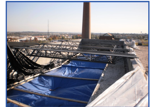
Installation of Autoclave

AFG is providing construction management services for the installation of a new pass-through autoclave unit to replace an existing, aging unit. The actual autoclave will be set on the second floor, mechanical wing, currently unoccupied. Renovations will convert an existing dry storage area to a clean storage and staging area. The facility is partially occupied, although the actual work area is not occupied.