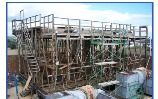
Demolition of Cooling Tower

AFG is providing design phase management services during the design for the demolition of the existing cooling tower, which is worn, outdated, and subject to continuous breakdowns. AFG is working with the NIH design firms to develop a construction plan to properly dismantle and remove this rooftop unit without significant impact to building occupants.